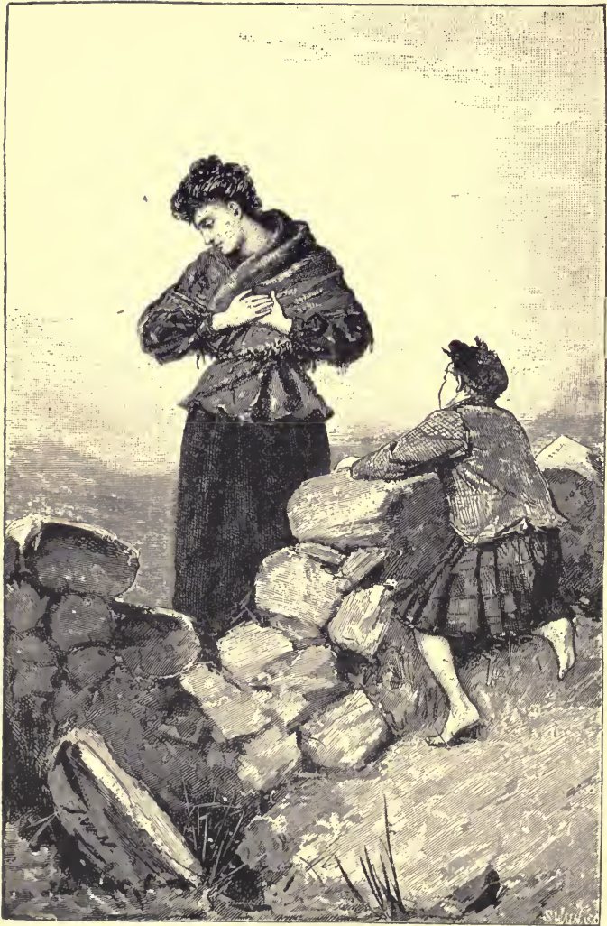
“YOU NICHT GANG AWA’,” HE ENTREATED.— Page 191.